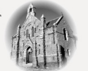
Auchmohill Church, 1887

In the 1696 Poll Tax records the surname of Wain, Watt and Watt dominate the population of the village. In 1873 a school was established at the top of the hill, and ten years later the Auchmohill Church was built near the top of the hill. By 1891 the population had grown to be almost 300 people. During the early 20th century some women enough work as many people had to leave – with some emigrating to New Zealand, America and Canada.